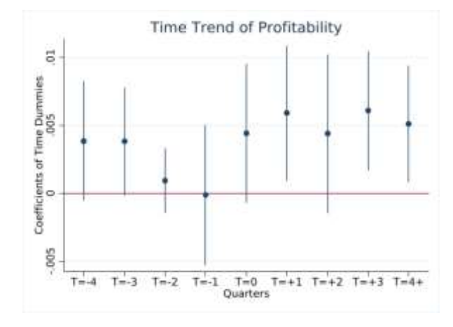
Panel A: Time Trends of Profitability

We plot the time trends comparing the performance of corporate investors in financial service sectors and control firms in the same 3-digit SIC code. The corresponding empirical specification is equation (8) from the paper. T=-1, T=-2, T=-3, and T=-4 are indicator variables that takes the value equal to 1 for all treated and control firms between day 1 and day 90, day 91 and day 181, day 182 and day 273, and day 274 and day 364 prior to the investment date; otherwise the indicator variable is equal to 0. T=+1, T=+2, and T=+3 are indicator variables that takes the value equal to 1 for all treated and control firms between day 92 and day 182, day 183 and day 273, and day 274 and day 364 after the investment date; otherwise the indicator variable is equal to 0. T=4+ is an indicator variable that takes the value equal to 1 for all firms in a cohort for all days or quarters after 365 days post the investment date of that cohort; otherwise it is equal to 0. T=before -4 is an indicator variable that takes the value equal to 1 for all firms in a 265 days prior to the investment calendar-year quarter of that cohort; otherwise it is equal to 0. T=before -4 is omitted due to multicollinearity. The confidence interval is 10%. Panel A and Panel B shows the plots for the following dependent variables: profitability and market valuation, respectively.