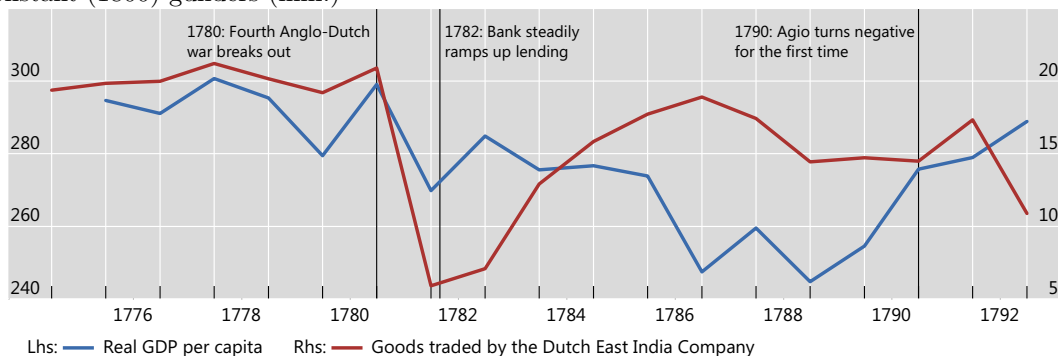
Figure 2: Output and trade in the Netherlands during the Bank's downfall, 1775-92 in constant (1800) guilders (mln.)